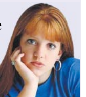
Need help? Don't be afraid or embarrassed to ask for it.

And do it now. Drinking or drugs may be your family's problem today, but they don't have to be a problem forever. ■