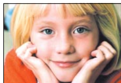
Shaking shadows. Slipping the grip of a parent's addiction starts when you learn to love the child they forgot to.

There never has been—and never will be—a better time to put the past in its place. So why wait? ■