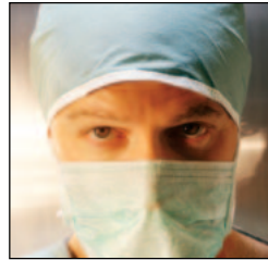
Flashpoint. Barbiturate OD's are often lethal because the drugs depress all areas of the brain—even breathing centers.

And that task becomes even more difficult when alcohol (or